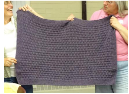
Kim Jarodsky Seed stitch & basket weave baby blanket Perfection Kraemer yarn in ‘Evening Song’