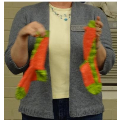
Lorraine Tompkins “Sand” sweater ColourMart Lambswool “Watermelon Slice Socks” Knitter’s Brewing Co Sock-aholic yarn